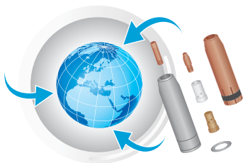
Wear parts compatible with the most common standard in Europe.